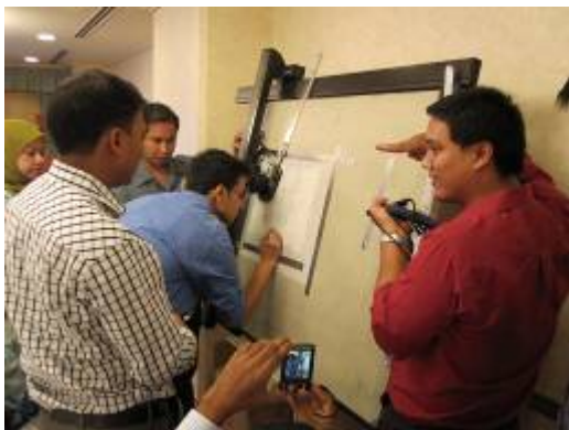
—Machine Drafting —

In the Study Visit Program, Tsurumi-Pla Co., Ltd., demonstrated the practical skill test of Plastics Molding Injection for trainees, and Higashi-Osaka Technical Vocational High School, Excedy Co., Ltd., and Panasonic Corporation welcomed the visit by trainees. All of the trainees found the Workshop and its study visit so beneficial for each.