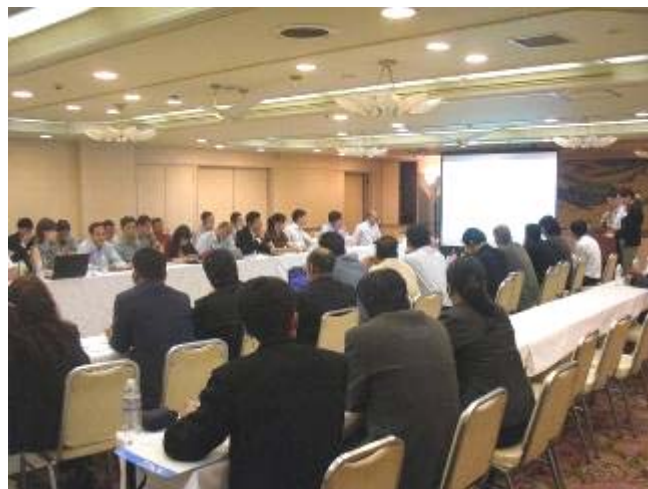
—Final report session by country—